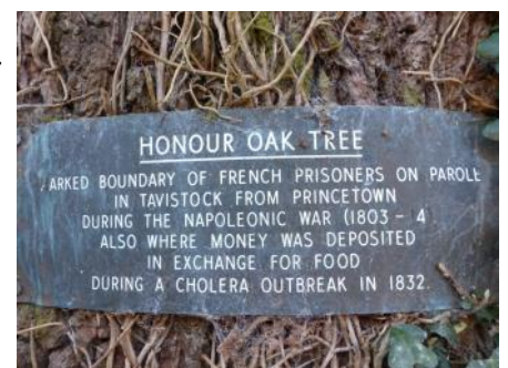
Honour Oak tree plaque, Whitchurch