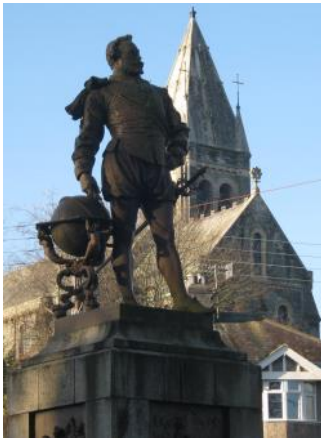
Drake's statue in Tavistock